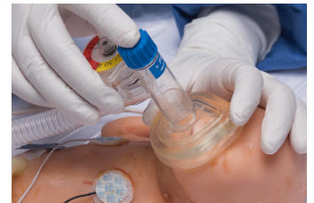
Positive pressure ventilation