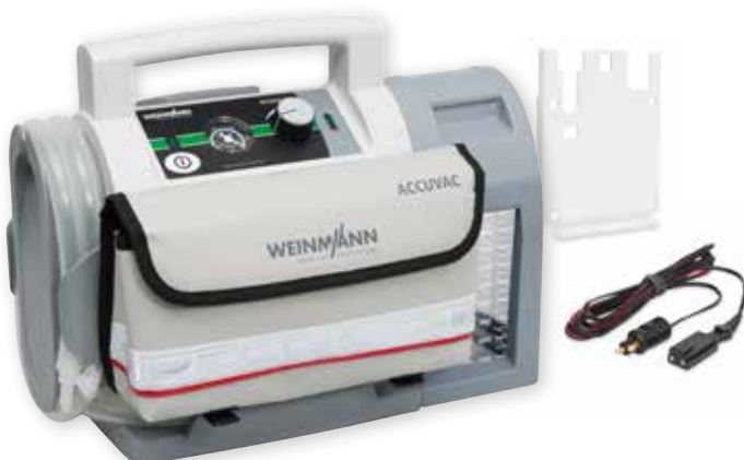
ACCUVAC Lite with reusable canister system, wall mounting, accessories bag and 12-V connection cable, WM 11720

The negative pressure range of ACCUVAC Lite can be infinitely set and adjusted with the easy-to-use vacuum regulator. The range of settings allows the pump's use for babies, children and adults. In addition to suctioning airways, ACCUVAC Pro also deflates vacuum splints and mattresses.