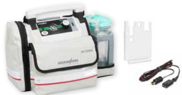
ACCUVAC Lite with disposable canister system, wall mounting and 12-V connection cable, WM 11715 and protective bag, WM 11692